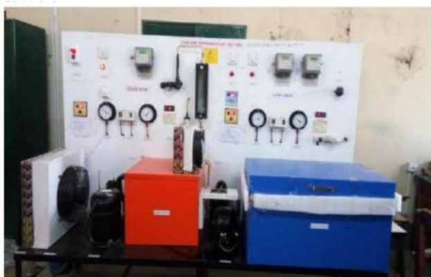
Figure 1: Pictorial view of Experimental Setup