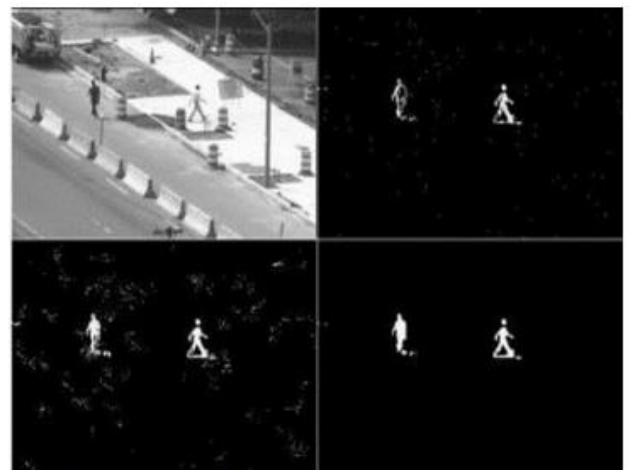
Fig. 1: Example of object detection by background removal

this difference is obtained by adding the contrast of each of the pixels contained in each of the rectangles and then simply the difference between the two is obtained. This process is performed on the entire image by moving the used rectangles pixel by pixel and reanalyzing the image by changing the size and shape of the used rectangles, in this way it is possible to detect objects of different sizes and shapes. Finally a filter is applied which limits the minimum value to eliminate the possibility of obtaining noise. [17] [18] [19].