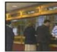
Figure 3.2 Bank