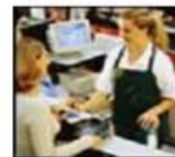
Figure 3.4 Retail shop