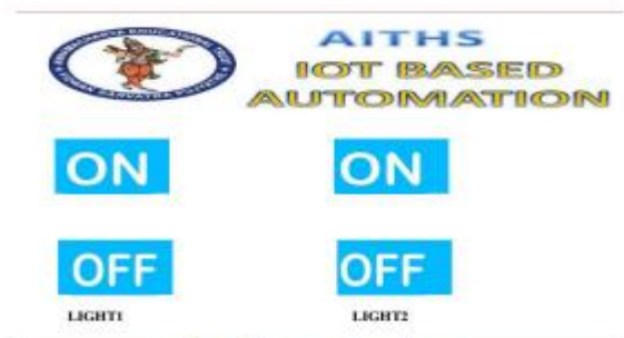
Figure 4.2 automation web page