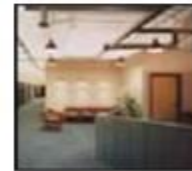
Figure 3.3 offices