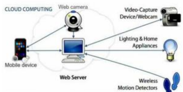
Figure 1.1 Expression Tree

will control all lighting and fans or any other electrical appliances. This board will have a Wireless connection that connects to an Internet hub. This Internet hub will be connected to the internet via LAN or Wi-Fi (Depends upon the choice of the user). As mentioned earlier the internet acts as a master since the entire control process is taken care of by an online server-side program (ASP or PHP modules). The user just has to login in to the specified webpage during the time of initialization and in case there is a need to change the automation settings. The web-page will be coded in such a way that it provides complete control to the user over the automation process such as timing and conditions for the automation process.