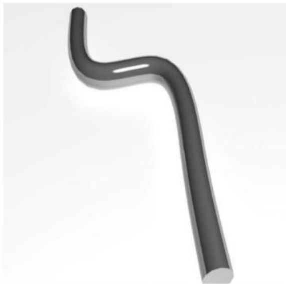
Fig. 1 Curvy metallic rod created using curve modeling technique

Polygonal Modeling: The greater part of the 3D models made today are utilizing polygonal demonstrating in light of the fact that they are anything but difficult to make and additionally the PC can render them effectively. The principle burden of polygonal displaying is that they polygons are unequipped for precisely speaking to bended surfaces, so a huge number of polygons must be utilized to speak to bended surfaces precisely. In polygonal displaying focuses in 3D space called vertices are associated by line fragments to shape a polygonal work.