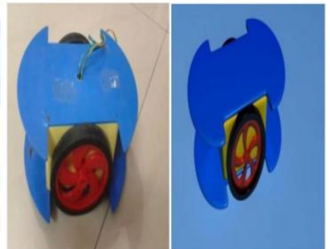
Fig. 3 A 3D model of the RC robot chassis

Fig. 3 A 3D model of the RC robot chassis A 3D model can have numerous individual parts which can be autonomously moved or pivoted in a virtual 3D space in the PC. Fig 3 demonstrates a picture of a servo engine and demonstrates the virtual 3D model of a servo engine.