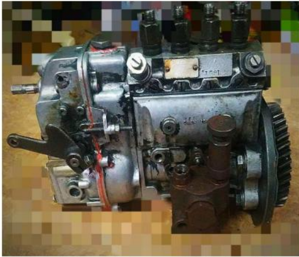
Fig .2. Actual fuel pump of TATA SFC 407