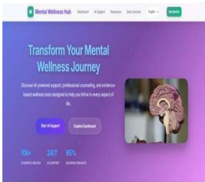
Fig. 2: Home Page