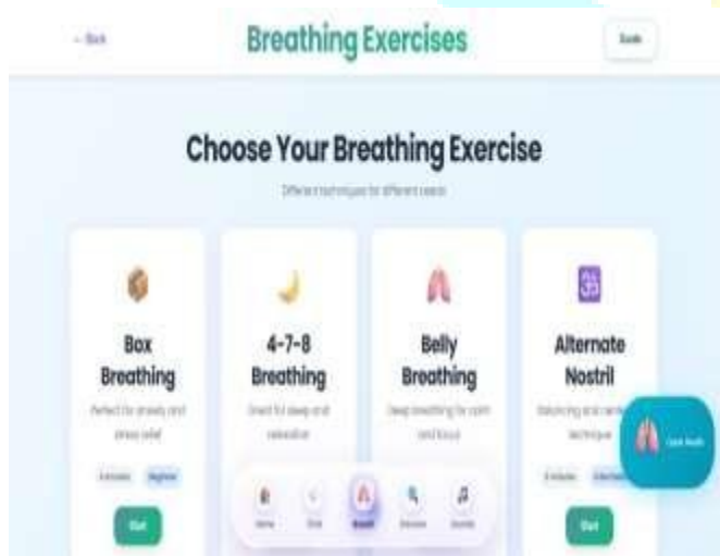
Fig. 3: Activity Page