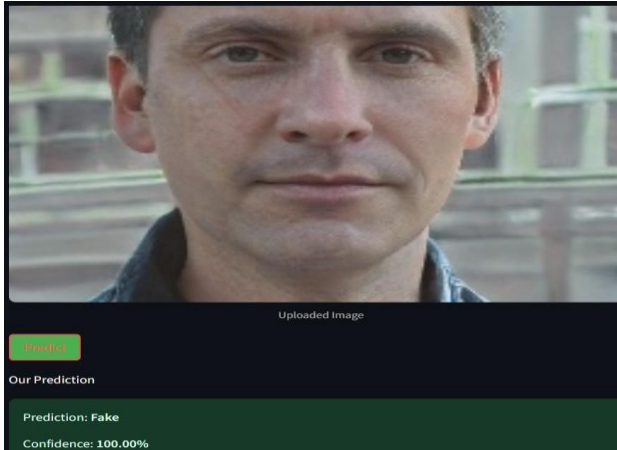
Fig. 2. Output page